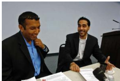
BUY THIS PHOTO