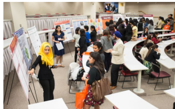
Summit participants learn from their peers who have conducted youth-focused or youth-driven community projects via a poster session.