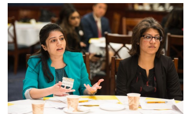
Summit participants having a robust conversation at the Community Briefing at the Capitol during Advocacy Day.