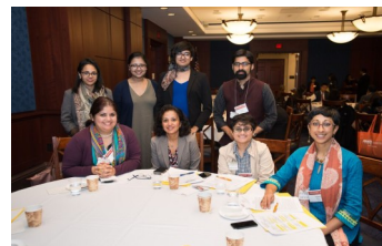
Summit participants before Advocacy Day.