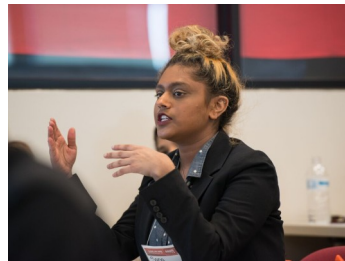
Summit participant engages panelists on how South Asians can prepare for DACA and DAPA.