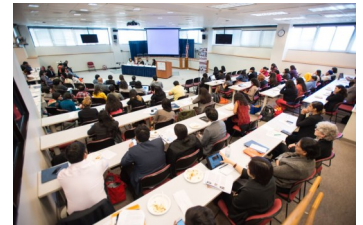
Summit participants contextualize the role of South Asians in the Black Lives Matter movement.